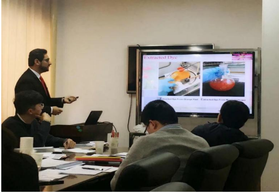
毕业答辩 Graduation Defence