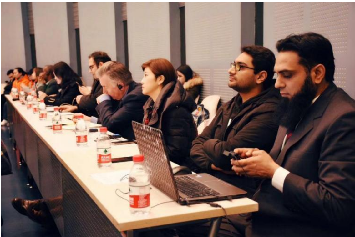
学术交流 Academic Communication