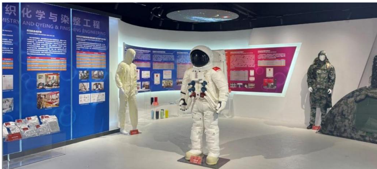
科研成果展厅 Exhibition Hall of Scientific Research Achievements