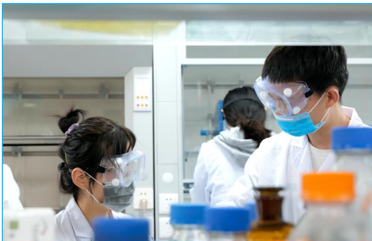
实验室一角 Corner of the lab